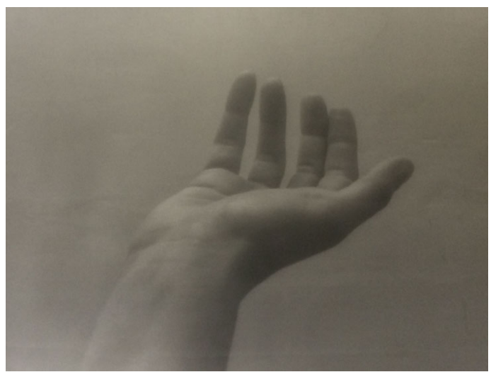
(Image) Mark Garry, Motion Gram 1, 2019, Silver Gelatin Print, 103 x 70cm